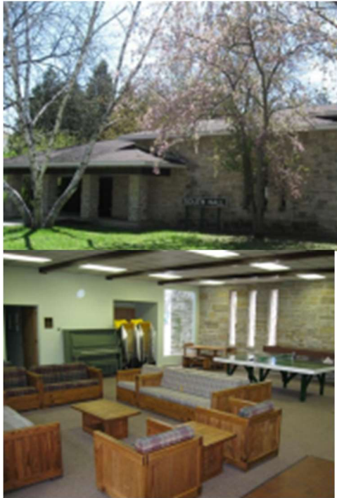
(Robins South Cabin)

Green Lake Conference Center Robins South Cabin W2511 Highway 23 Green Lake, WI 54941